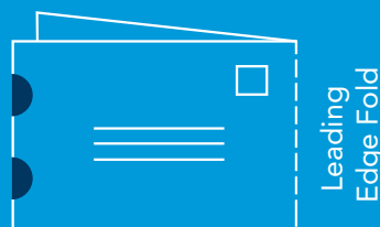
Leading Edge Fold